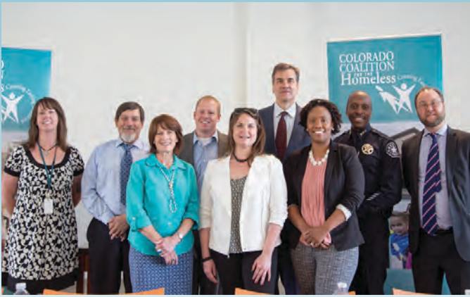
Partners from CCH, CSH, the City of Denver, Law Enforcement, and the White House Office of Social Innovation.